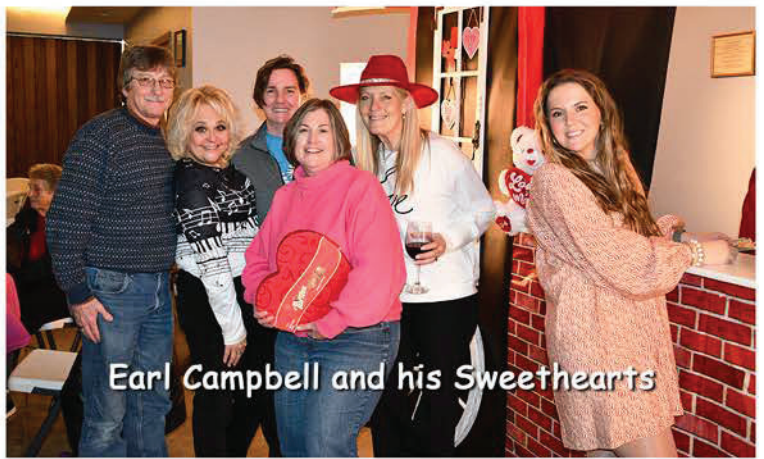
Earl Campbell and his Sweethearts