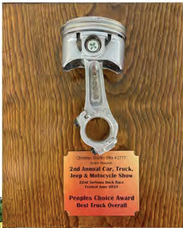
Christian County Elks #2777 Club Sponsor 2nd Annual Car, Truck, Jeep & Motorcycle Show 22nd Sertoma Duck Race Festival June 2023 Peoples Choice Award Best Truck Overall