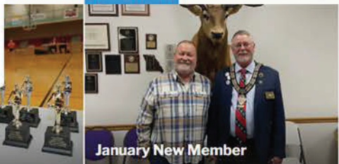
January New Member