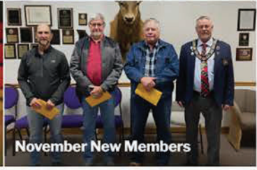
November New Members