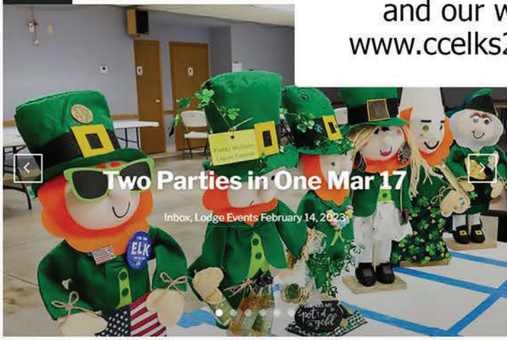
Two Parties in One Mar 17