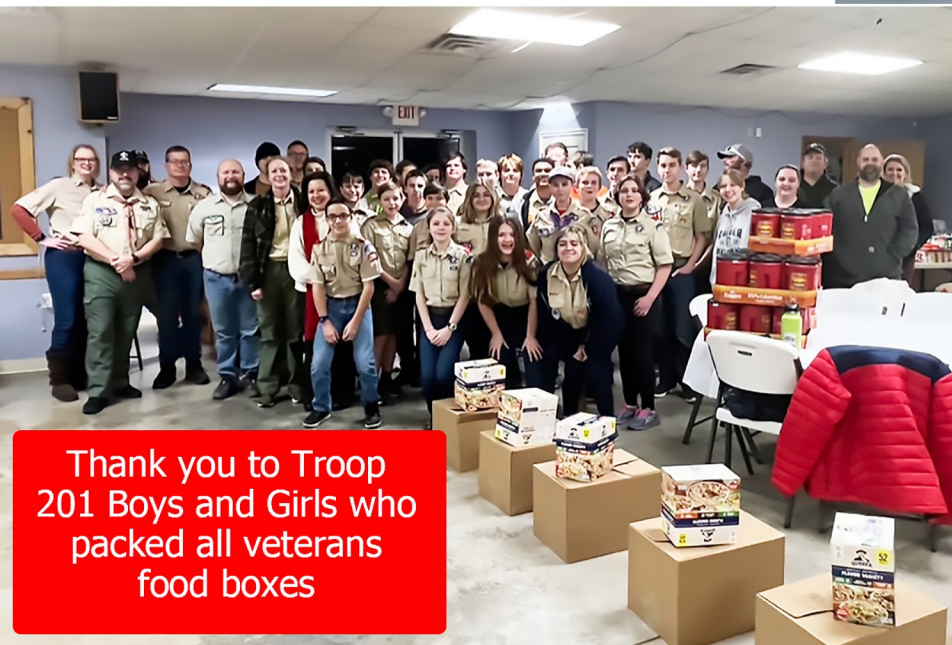
Thank you to Troop 201 Boys and Girls who packed all veterans food boxes