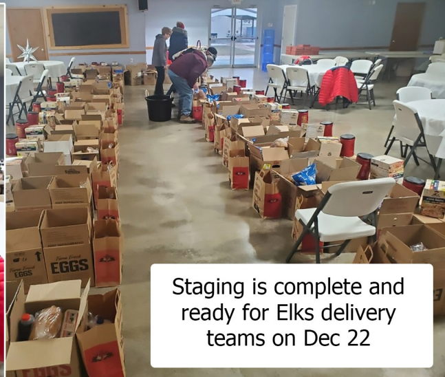
Staging is complete and ready for Elks delivery teams on Dec 22