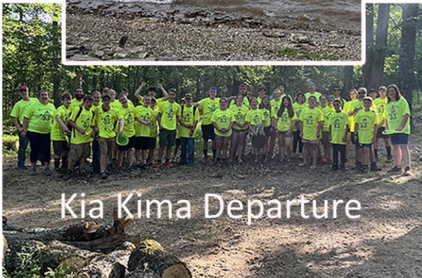
Kia Kima Departure

It's been another fun-filled summer for Troop 201! The highlight of the summer was definitely our week of Resident Camp June 12-18, at Kia Kima Scout Reservation outside Hardy, Arkansas. During our 7-day camp, many adventures were had, new scout skills were learned, and merit badges were earned. We had several days with a heat index over 100 degrees, with the hottest being 115, so proper hydration and attire were critical.