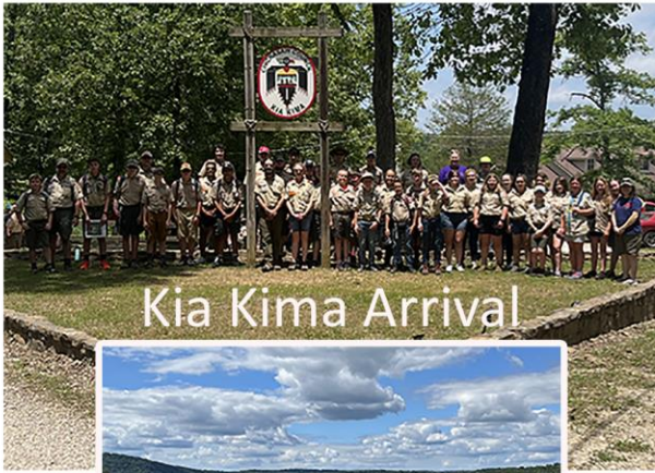
Kia Kima Arrival