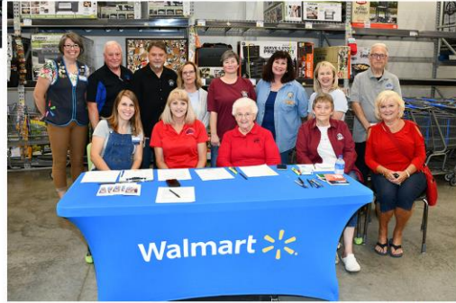
4 Saturdays in July 260 Kids $26,000 in Grants and Donations A Thousand Smiles