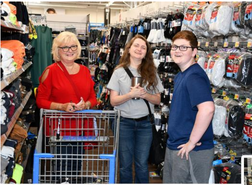
Back to School Shopping for Kids