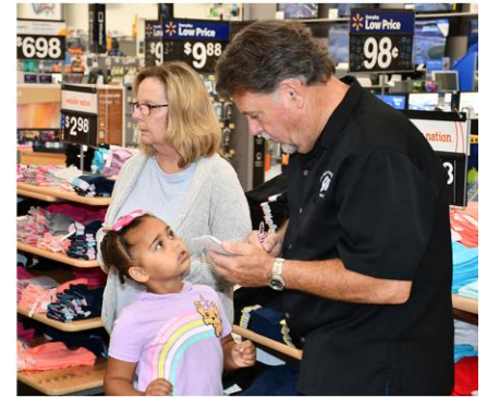
Charity Community Fellowship